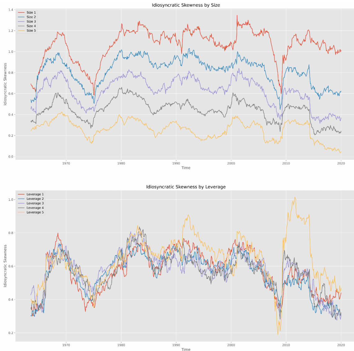
FIGURE 1 IDIOSYNCRATIC SKEWNESS BY SIZE AND LEVERAGE

This figure plots portfolio level idiosyncratic skewness, which is defined as the equally-weighted average idiosyncratic skewness across all firms within a specific portfolio. The upper (lower) panel shows portfolio average idiosyncratic skewness for five size-sorted (leverage-sorted) portfolios. We re-balance each portfolio at the beginning of each year. In the upper panel, Size 1 (5) represents average idiosyncratic skewness of the smallest-firm (largest-firm) portfolio. In the lower panel, Leverage (1) plots average idiosyncratic skewness of firms in the lowest (highest) leverage quintile. The sample period is from July 1965 to December 2019.